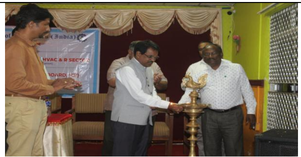
Lightening of Traditional Lamp by IE(I) PSC Chairman & Honorary secretary