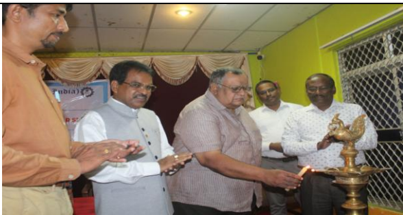
Lightening of Traditional Lamp by Chief Guest