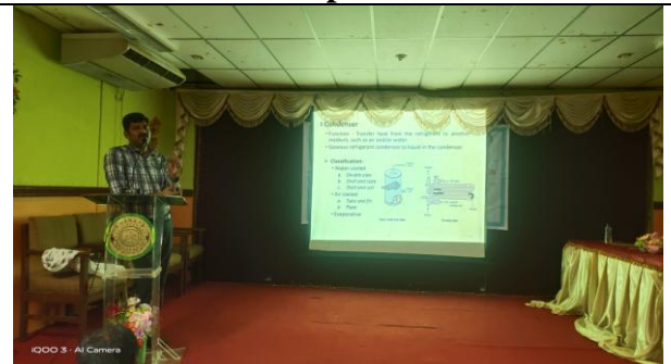
Technical Session 1 - Invited Lecture by Mr.R.Ilandjezian, AP/Mech, MIT