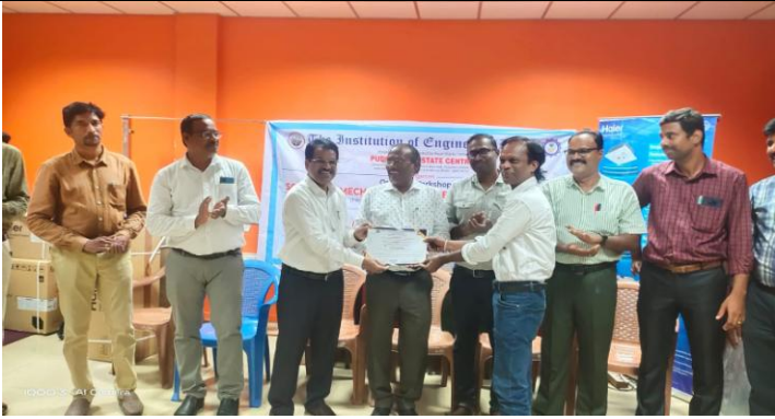
Valedictory & Certificate distribution Session