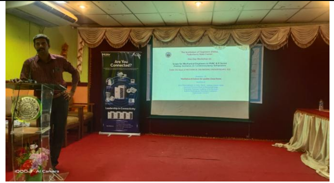
Technical Session 2 - Invited Lecture by Mr.A.Thiagarajan, AP/Mech, MIT