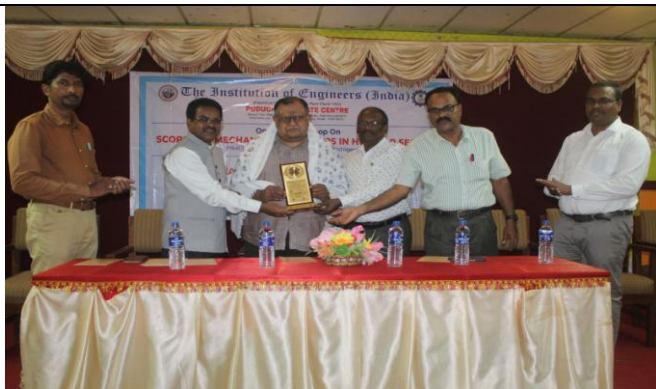
Honouring the Chief Guest with a Memento & Shawl