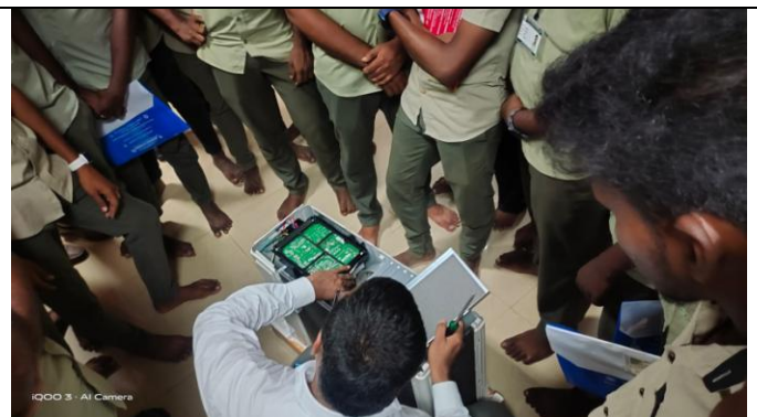
Technical Session 6 - Hands on Training by HAIER Team