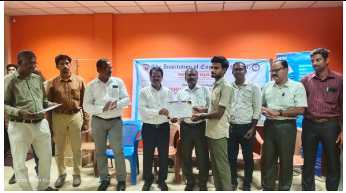
Valedictory & Certificate distribution Session