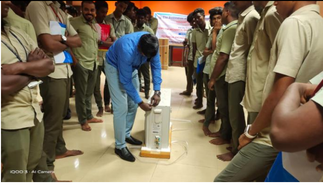
Technical Session 6 - Hands on Training